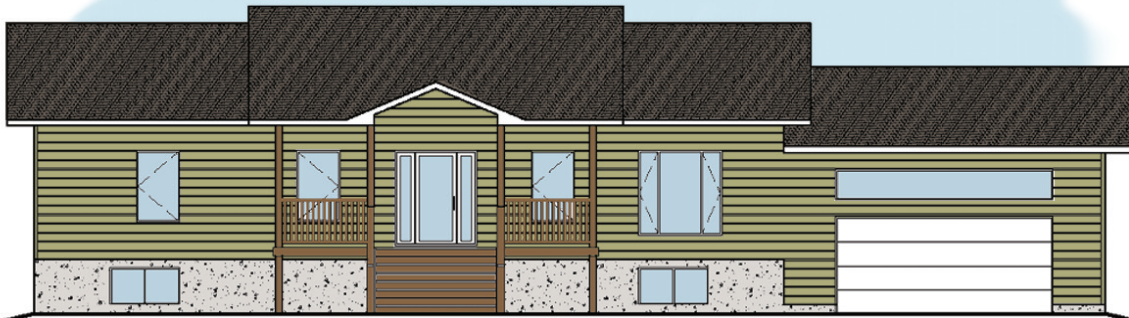
Some features shown may be optional