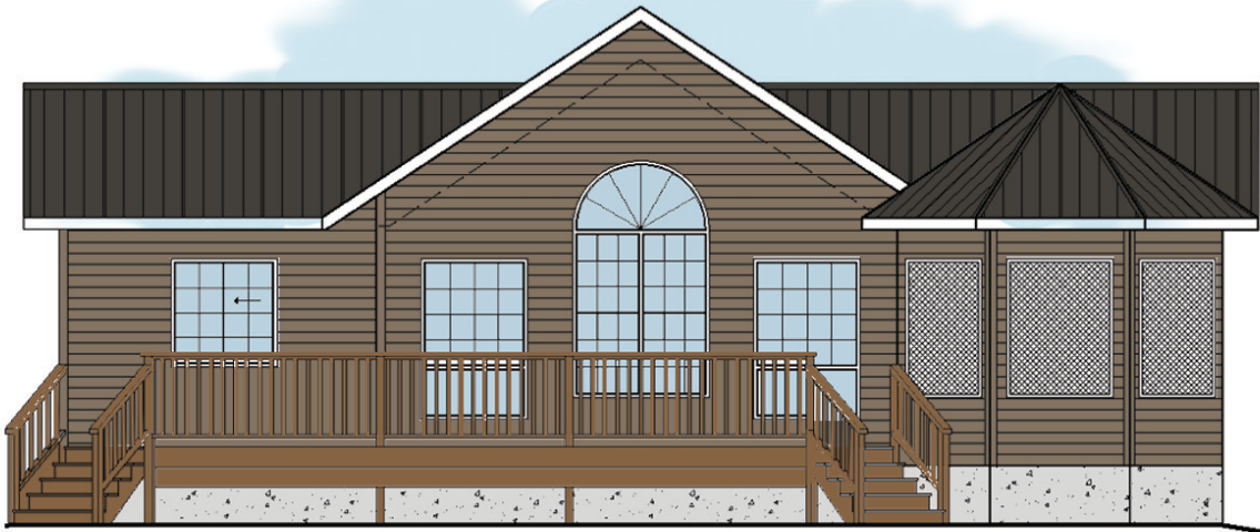
Some features shown may be optional