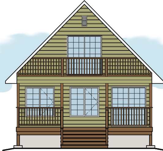
Some features shown may be optional