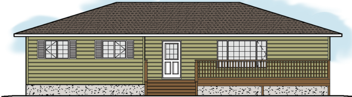
Some features shown may be optional