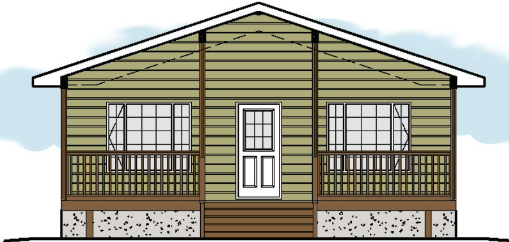
Some features shown are optional