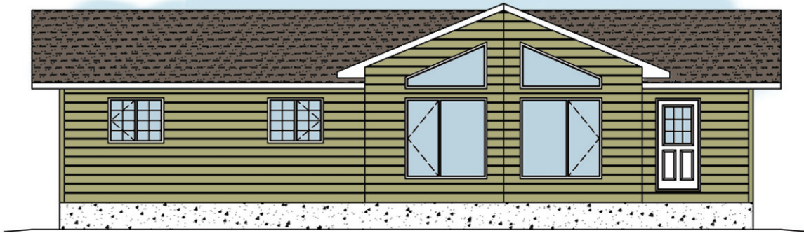
Some features shown may be optional