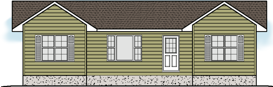
Some features shown may be optional