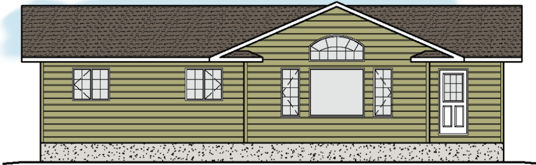
Some features shown may be optional