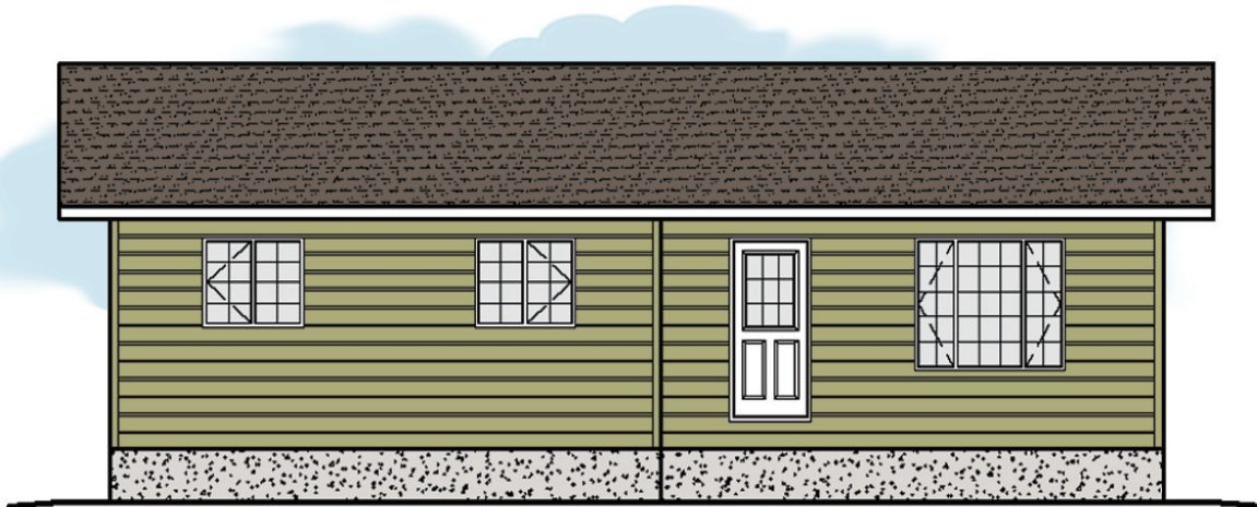
Some features shown may be optional