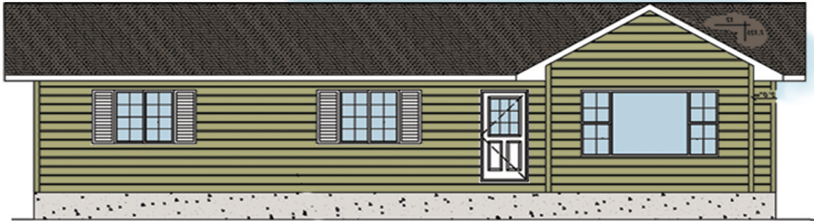
Some features shown may be optional