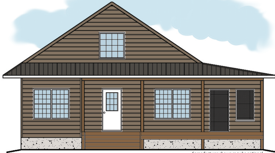
Some features shown may be optional