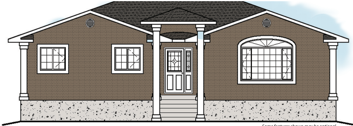
Some features shown may be optional