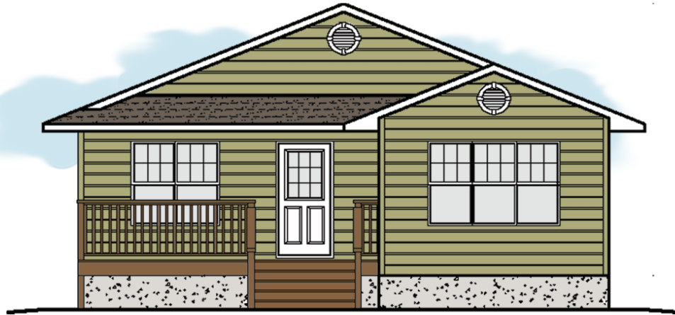
Some features shown may be optional